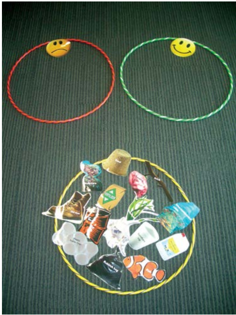
Figure 1 'The nest' hula hoop